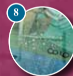
8 Numeral '7' and Goal Post The numeral '7' and a rugby goal post with a rugby ball can be seen when the banknote is tilted at an angle.