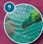
9 Blind Recognition There are raised areas in the shape of a rugby ball which can be felt by running your fingers over it.