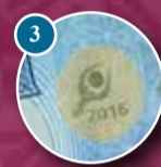
3 Optically Variable Ink (OVI) A special Optically Variable Ink (OVI) depicting the gold medal is embossed with the RBF logo, the tagaga, and the year 2016.