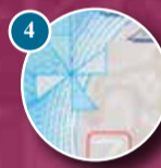
4 See-through Feature Designs from the back of the banknote neatly fills the designs on the front of the banknote when the banknote is held up against the light.