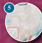
5 Watermark Watermark depicting Fiji Rugby 7s Olympian Savenaca Rawaca OF, in motion with a rugby ball.