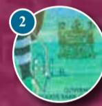
2 Coat of Arms and Signature Fijian Coat of Arms and Signature of the Governor of the Reserve Bank of Fiji is present on all banknotes.