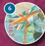
6 Serial Numbers Vertically and horizontally oriented serial numbers in red and blue fonts respectively with the prefix AU, the chemical symbol for Gold.