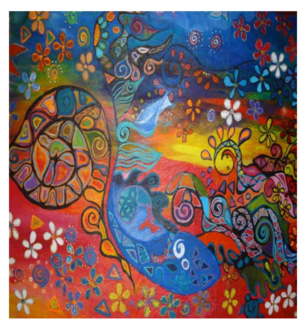
"Bringing out the best in a person is often a catalyst for bringing out the best in the team."